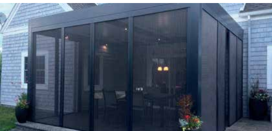
MOSQUITO NET SLIDING DOOR